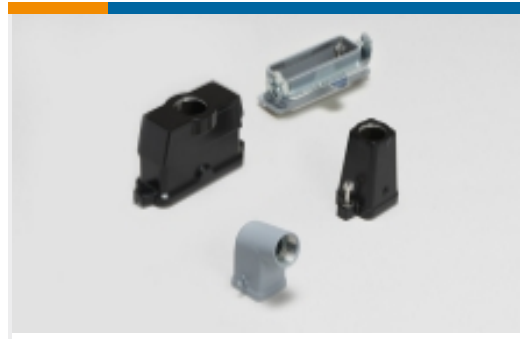
Rectangular Connector Hoods & Bases (445)